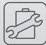
Battery Activation & Repair