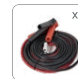
Battery Clip Line( 5M)