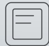
Programming Power Supply